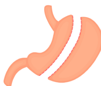
VERTICAL SLEEVE GASTRECTOMY