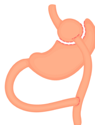
ROUX-EM-Y GASTRIC BYPASS